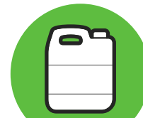
Pesticide and fertilizer containers up to 23L

Keep all caps and/or closures in place. Do not remove cages from 1,000L totes; otherwise, they won't be accepted.