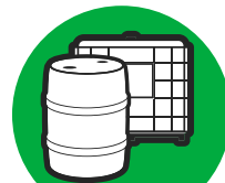
Pesticide and fertilizer totes & drums

Return properly prepared materials to participating retailers. Check beforehand which materials they accept.