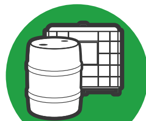
Pesticide and fertilizer totes & drums

Return properly prepared materials to participating retailers. Check beforehand which materials they accept.