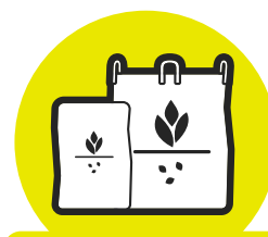
Seed, pesticide & inoculant bags & large tote bags