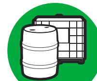
Pesticide and fertilizer totes & drums

Obtain free collection bag from ag retailer.** Place emptied and rinsed containers into the bag to return.