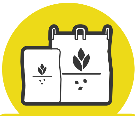
Seed, pesticide & inoculant bags & large tote bags