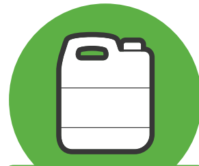
Pesticide and fertilizer containers up to 23L

Return properly prepared materials to participating retailers. Check beforehand which materials they accept.