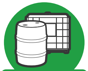
Pesticide and fertilizer totes & drums

Obtain free collection bag from ag retailer.** Place emptied and rinsed containers into the bag to return.