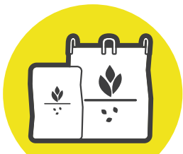
Seed and pesticide bags & large tote bags