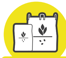
Seed, pesticide & inoculant bags & large tote bags