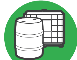
Totes (>23 l) non deposit (bulk pesticides and fertilizers)